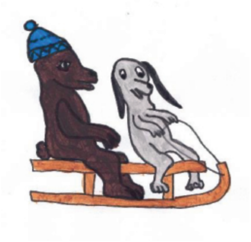
Dog and Bear on the second,