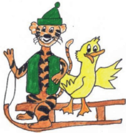
the Siberian tiger and Duck on the third,