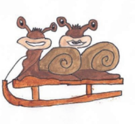
the snail family on the fourth