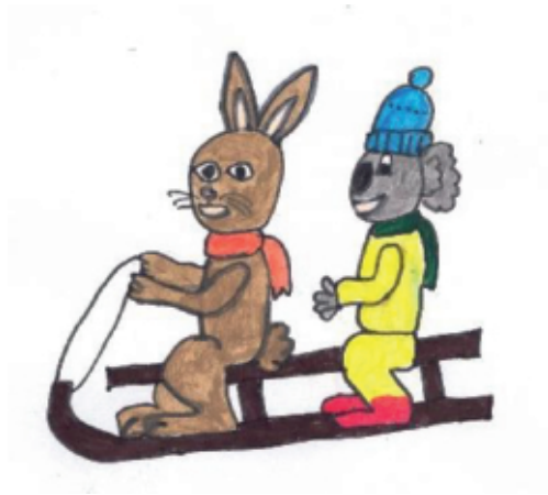
and Bunny and Koala on the fifth.